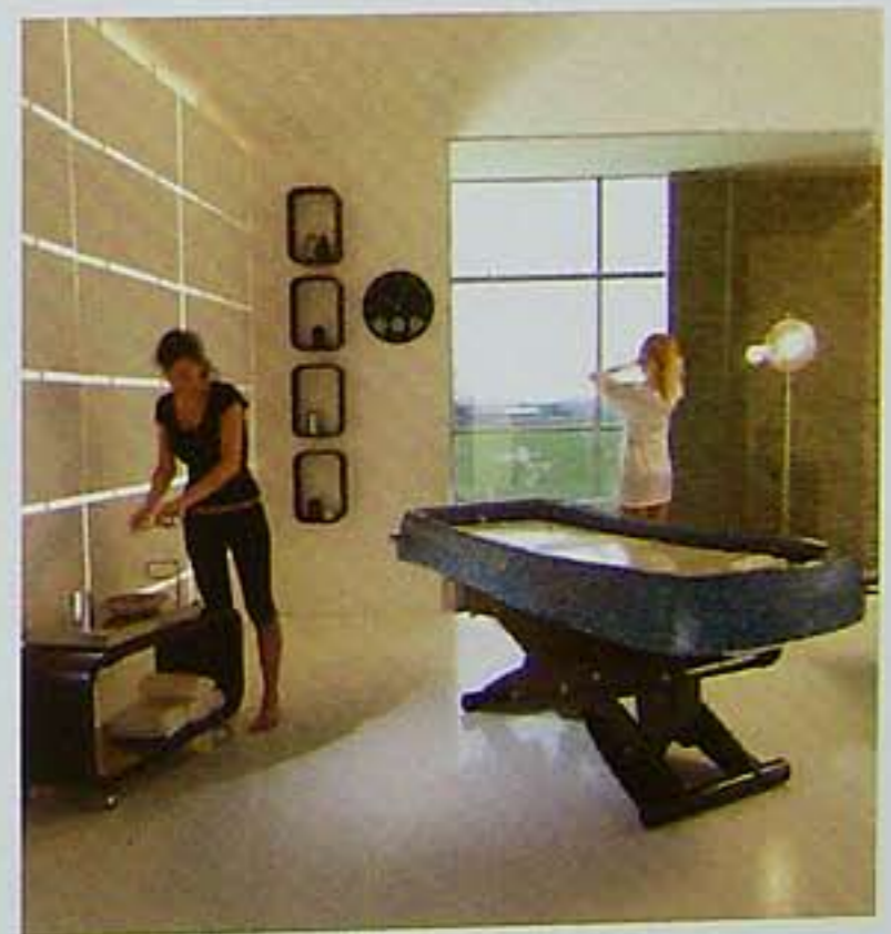
▲ Lemi Group is all about design and functionality