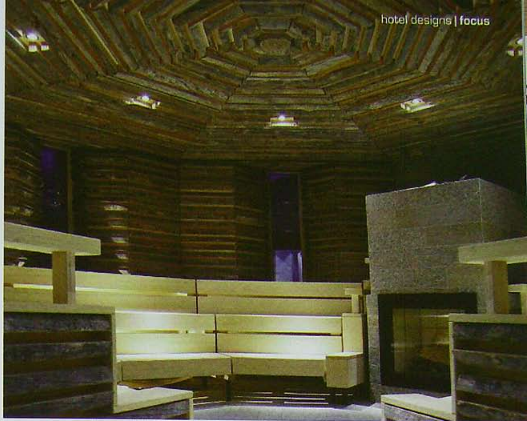
▲ Wonderful wood – Barr and Wray steam room

Barr + Wray is a leading provider of spa and pool engineering solutions and ideas for